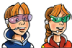
Finn and Star

4 Complete the sentences. Use the present simple.